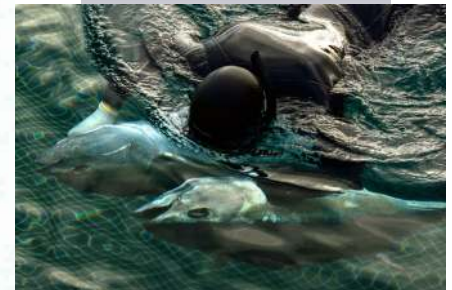
Below: Diver swimming SBT to harvest vessel